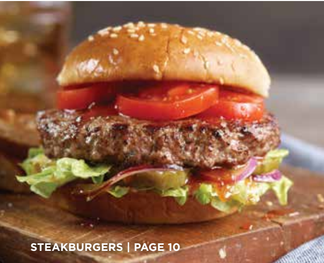
STEAKBURGERS | PAGE 10