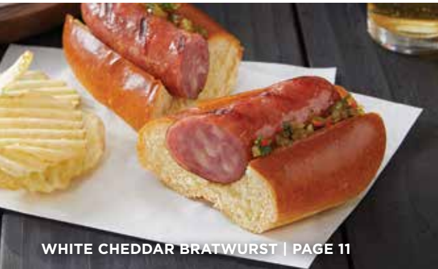
WHITE CHEDDAR BRATWURST | PAGE 11